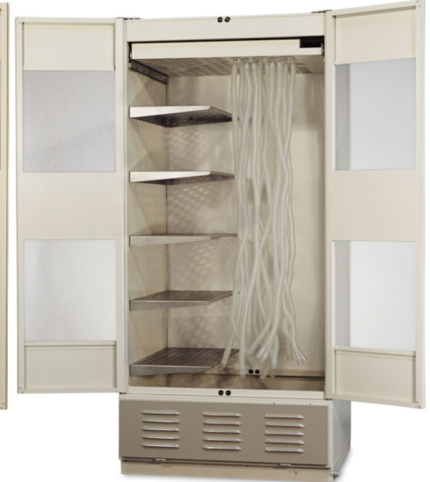
Model 1009 with Half-Width Shelving and Tube Drying Rack Options