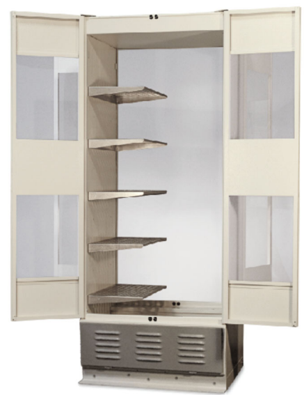
Model 1010 Configuration with Half-Width Shelving Option