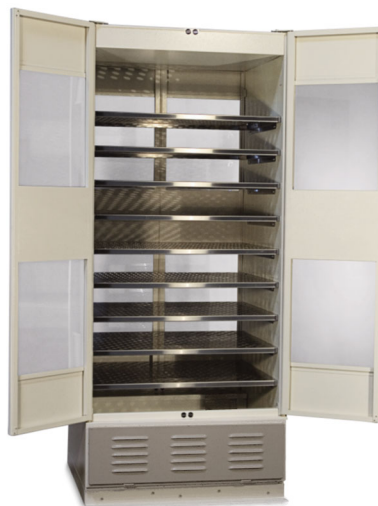
Model 1010 with Maximum Full-Width Shelving Option