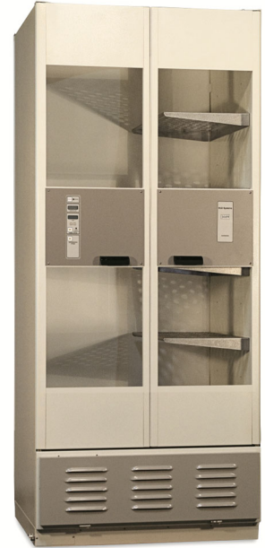
Model 1009 Configuration with Half-Width Shelving Option

Two years against defective material and workmanship, with an optional Extended Warranty Plan available. Toll-free technical assistance for the lifetime of the unit.