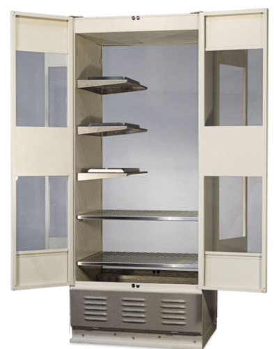
Model 1010 with Half-Width & Full-Width Shelving Option and Small Parts Trays Options