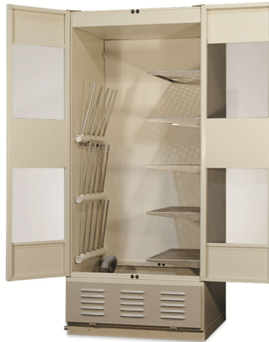
Model 1009 with Half-Width Shelving and Bag & Bottle Rack Options